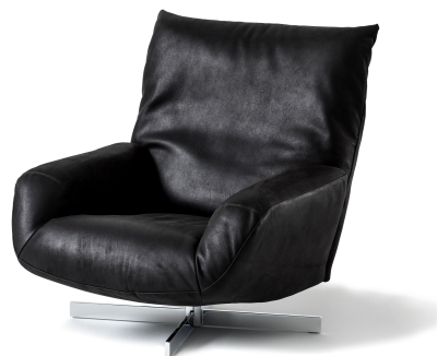
CHR010 poltrona armchair fauteuil Sessel

The base with four-spoke profiles and steel turned parts is finished in brushed nickel polished chrome and enables the pivoting system.